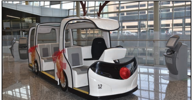
Above: The CTS vehicle prototype has arrived and is ready for its closeup