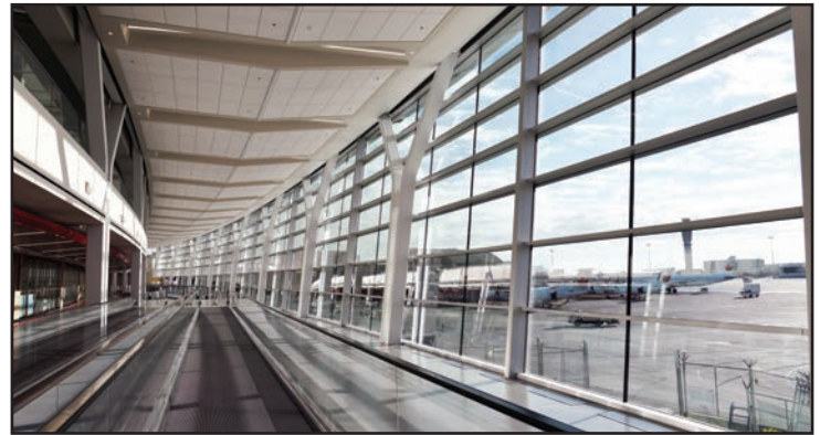
Above: Check out that view! The Connections Corridor is complete