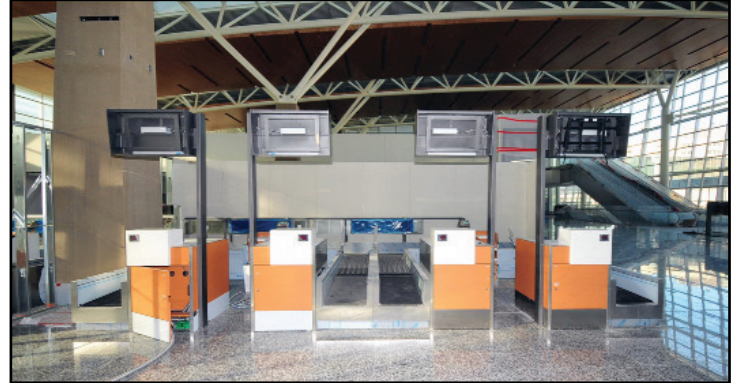
Above: Next in line. Just a few of the many airline check-in counters

Trivia: The new terminal will feature two new concourses, 25 additional passenger boarding bridges, and a 318-room hotel.